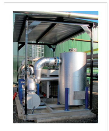
Biogas plant Pustejov - GTS 1200