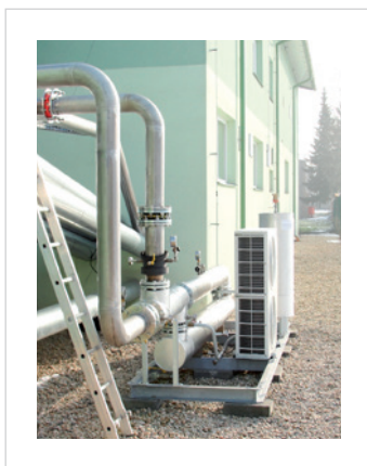
Biogas plant Vysoké Mýto - GTS 400