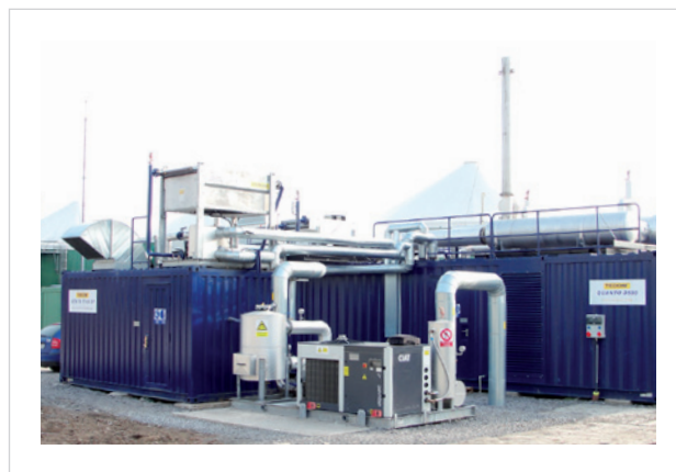
Biogas plant Chonkovce - GTS 800